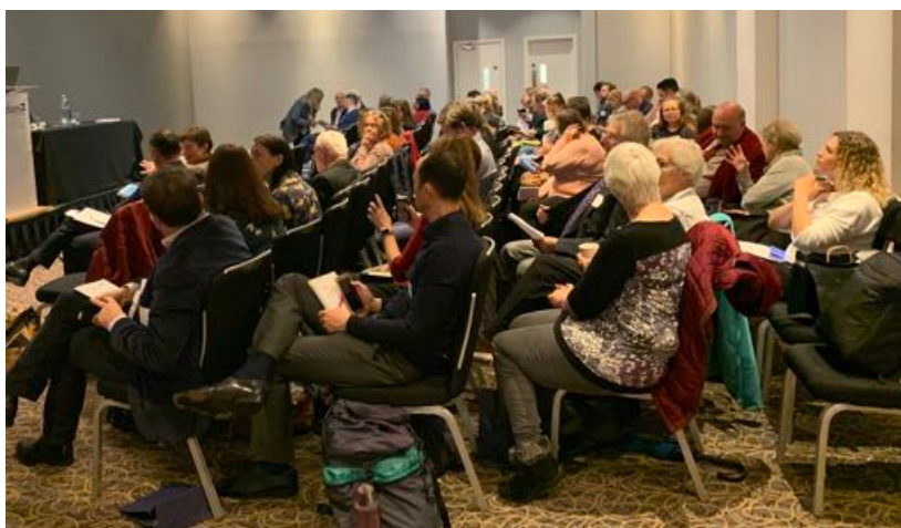
An attentive audience of more than 100 participants.