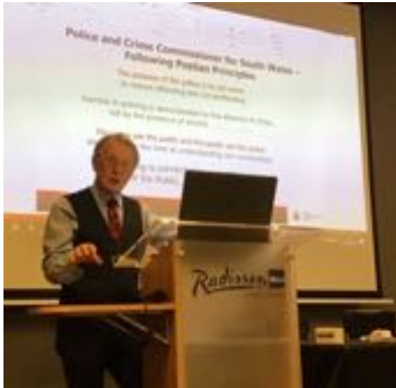
Rt Hon Alun Michael, Police & Crime Commissioner for S Wales